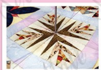
• Pattern from 90° block design