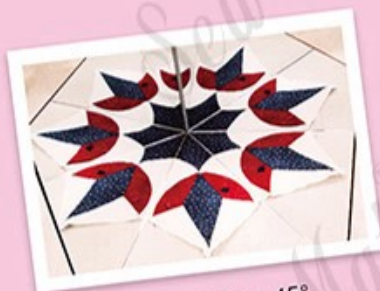
• Pattern from 45° block design