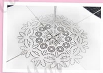
• Pattern from 90° block design on the paper design