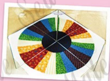
• Pattern from 60° block design