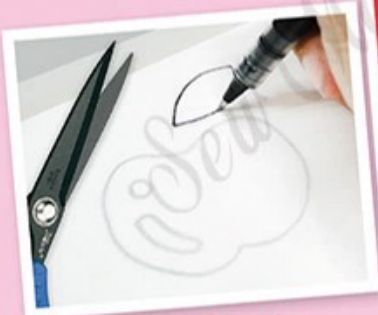
• Pattern Tracing