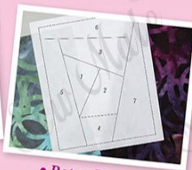
• Paper Piecing